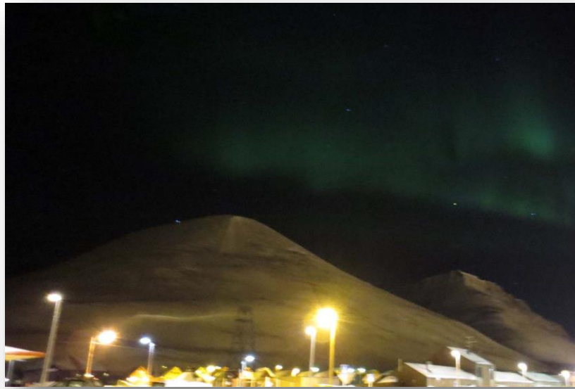
The aurora as seen from Longyearbyen.

It was stimulating to see academics and active politicians vibrantly exchanging ideas to determine how our interests overlap. The conference was an impressive example of practitioners seeking research to adjust their actions, while researchers learned what practitioners seek in order to act.