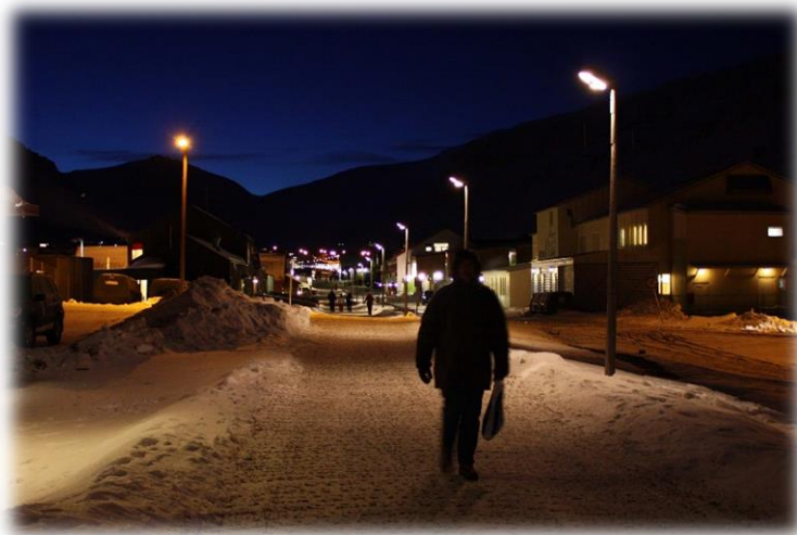
Longyearbyen at noon in mid-January.

We learned plenty about these legal, political, and logistical complexities through fascinating presentations and conversations with the Deputy Governor of the archipelago and the mayor of Longyearbyen. Small places can bring big challenges!