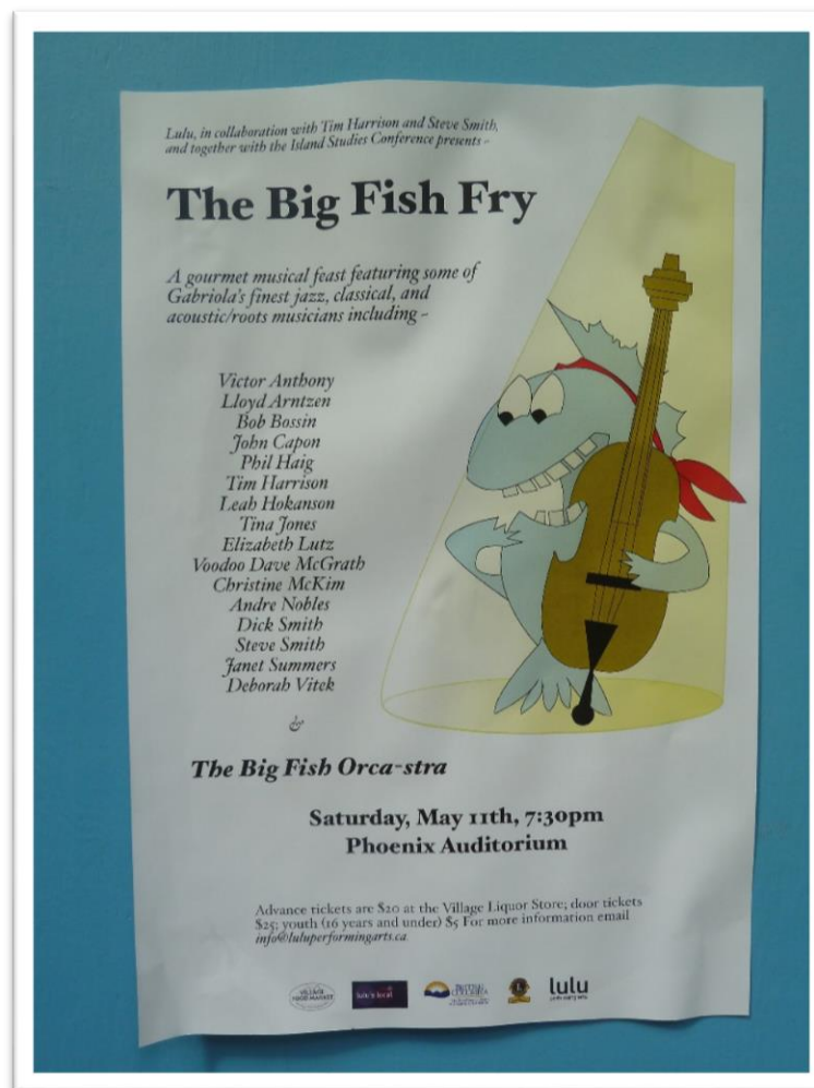
“Big Fish Fry” Cultural programme of local music and song.